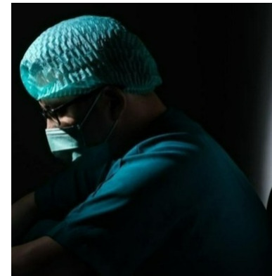
Stress First Aid