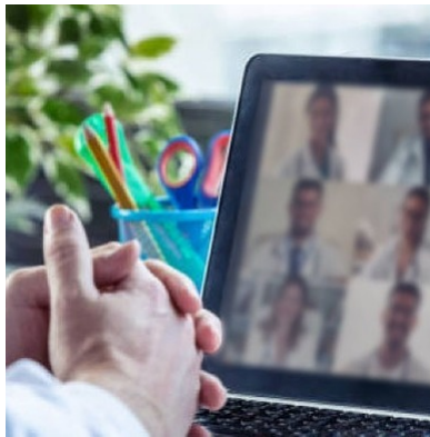
Member Learning Center